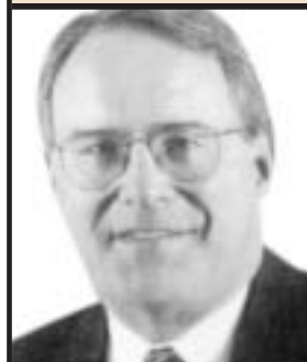
Speaker Ken Dryden, President and General Manager of the Toronto Maple Leafs and former Ontario Youth Commissioner