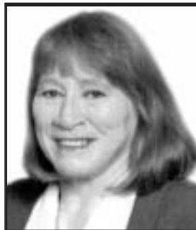
The Honourable Ethel Blondin-Andrew, Secretary of State (Children and Youth)